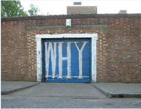
Click here for original