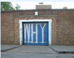
Click here for original